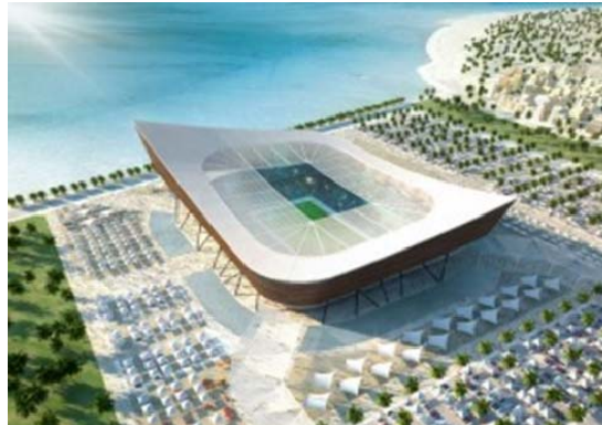
The new stadium design for the 2022 World Cup.

Celebrations in Qatar were huge upon receiving the event, with people pouring onto the streets of places like the capital, Doha, shouting and chanting. It was in stark contrast to Russia, where it was -4°F outside, so little outside public partying took place. None the less, the two countries are extremely happy to be hosting the tournament, where history will be made.