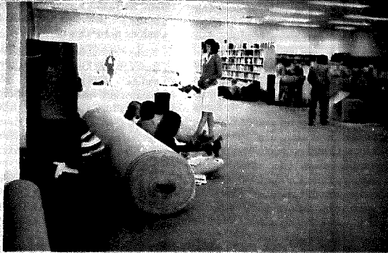
Several students utilize some of the present comforts of the partially complete library/media center.