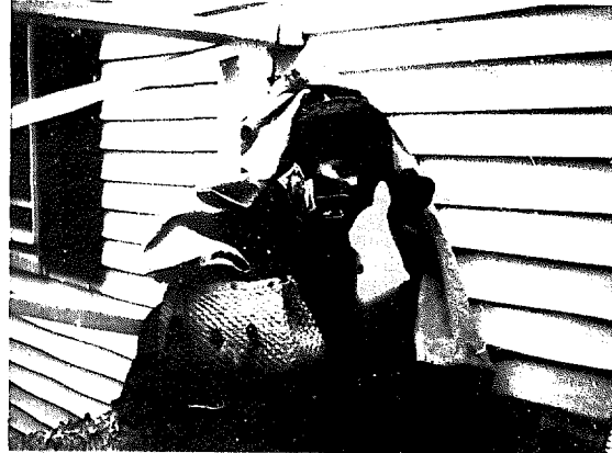
A DHS thief caught while running for refuge.

Playhouse Pub is a small, rustic bar in a convenient location. Its versatility of being a warm, intimate place or a bar to have a foot-stomping good time gave us the feeling of belonging the second we walked in. This gets FOUR cocktail glasses!!! YYYYY