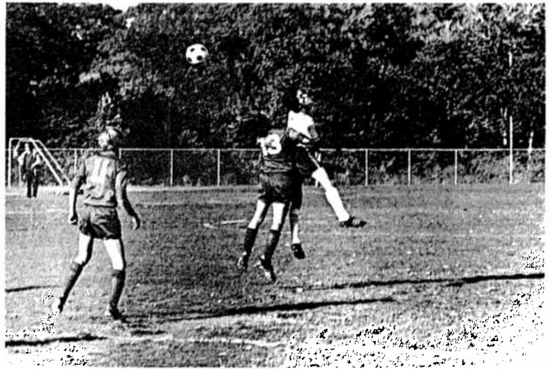
DHS Booters in action against Danbury.

Against Greenwich and Ridgefield Darien did a little better, losing to Greenwich 15-50 and Ridgefield 15-45. Once again the top finishers for Darien