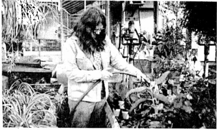
Member of the Green Thumb Club. The new DHS organization is concerned with ecology and plant science.