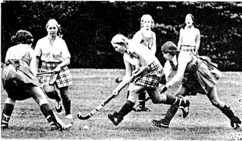
DHS hockettes hopping high as they shoot for States.