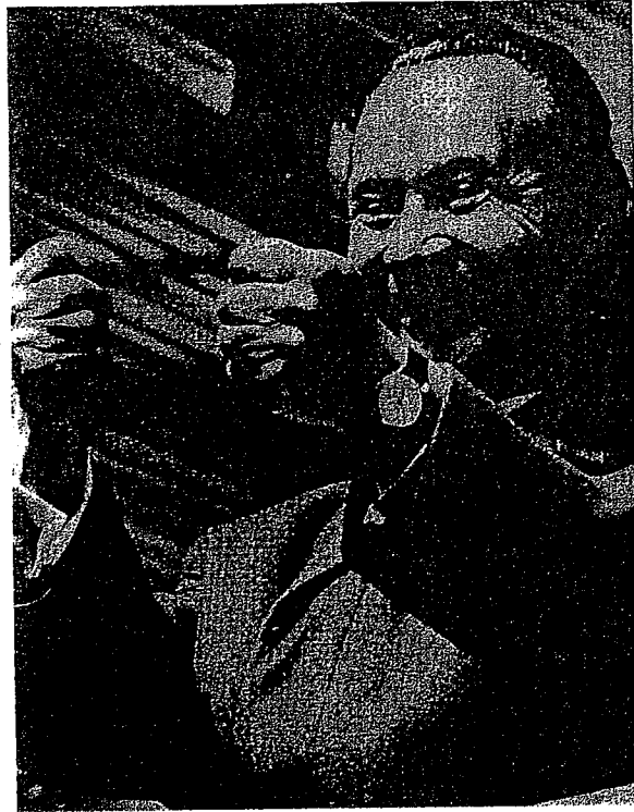
▲ Alexander Dubcek in May 1968. Unlike most communist party leaders, Dubcek enjoyed great popularity during his time in power.

15. There was a symbolic change shortly thereafter. For over ten years a gigantic statue of Stalin had stood in Prague (prahg), the capital of Czechoslovakia. In 1964 the statue was knocked over and removed. Many writers and artists began to speak out. In December 1967 Novotny was