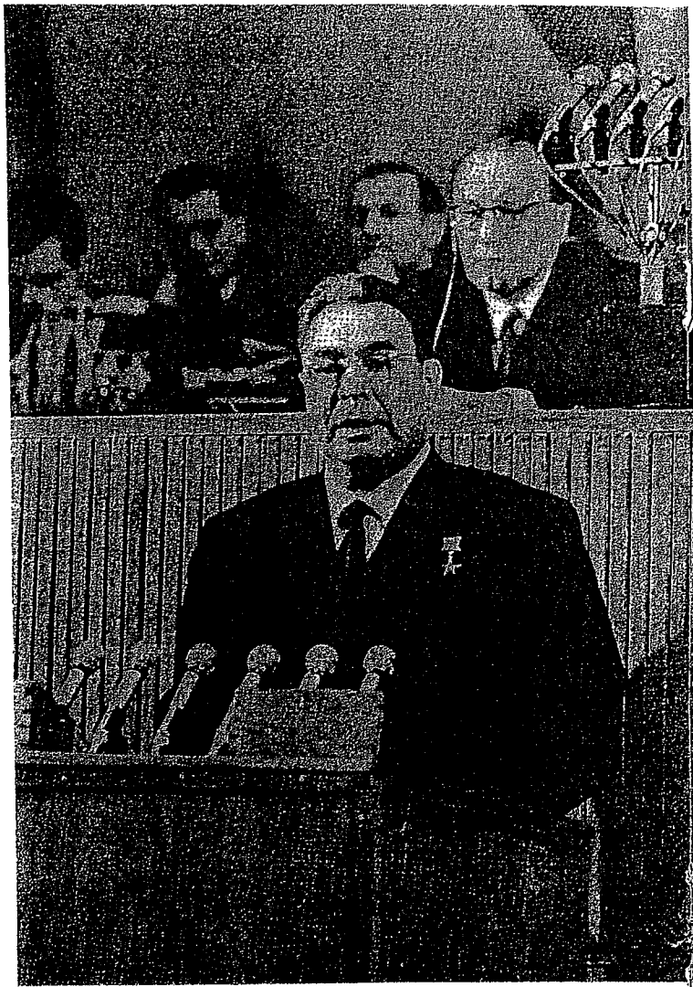
▲ Leonid Brezhnev gives a speech to a meeting of the Hungarian communist party in 1966. Behind him is Janos Kadar, Hungarian communist leader.

1. Greek mythology tells the story of Sisyphus (SIS-ih-fus), whose punishment was to push a huge stone up a hill forever. Every time he came close to the top, the stone would slip through his hands and roll back to the bottom of the hill. When the Soviet Union took over Eastern Europe, it found itself with a similar problem. The Soviet Union's unending problem was maintaining communism in its Eastern European satellites. The Soviets were able to restore order when trouble started, often by using force. However, after things were quiet for a while, trouble always arose again, and once again the Soviets would have to step in to restore their control. The greatest threats came from Czechoslovakia and Poland. In Czechoslovakia, a group of reformers within the communist party threatened Soviet control of the country. In Poland, the threat came from a labor union led by a determined electrician.