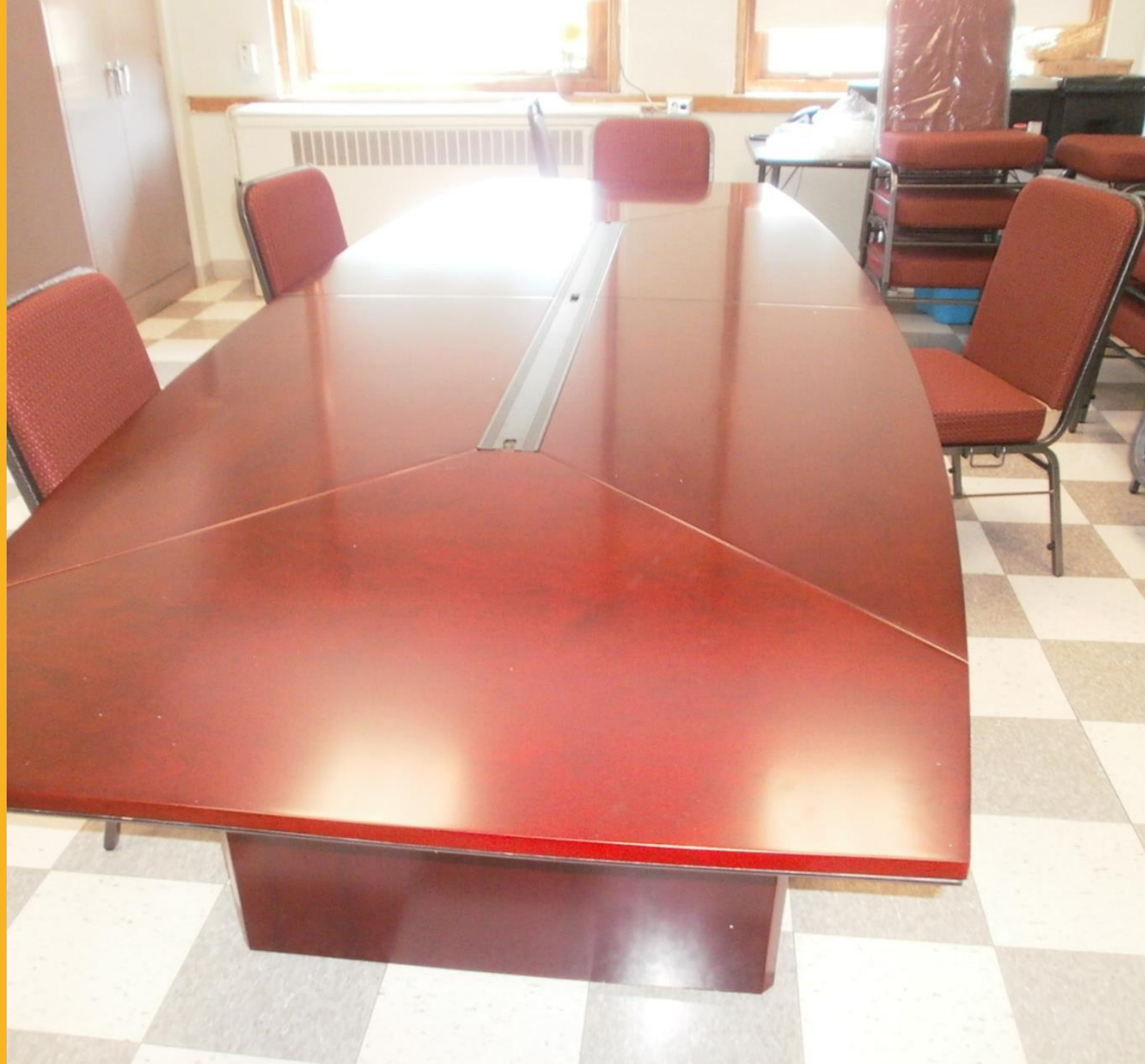
New tables and chairs for conference room